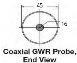
Coaxial GWR Probe, End View